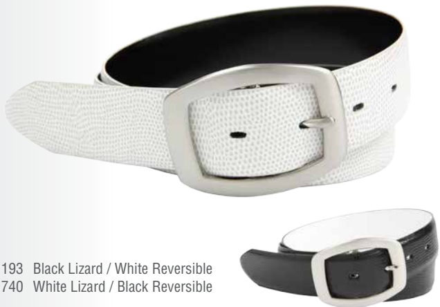
193 Black Lizard / White Reversible 740 White Lizard / Black Reversible

35mm genuine leather feathered edge reversible strap. Each strap features a lizard grain print reversing to a smooth grain. The removable center bar buckle has a brushed nickel finish.