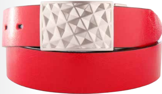
115 Black / Red Reversible

35mm genuine leather cut edge reversible strap. Removable geometric design plaque buckle in brushed finish.