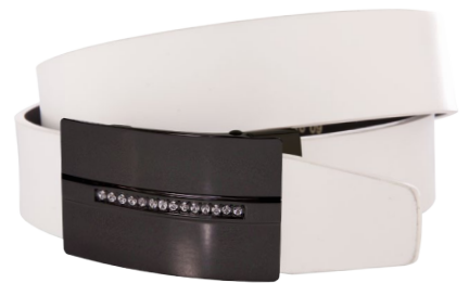
• 114121 765 White