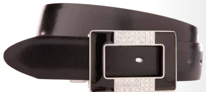
193 Black / White Reversible

35mm enamel and rhinestone inlay removable plaque buckle, which is paired with a black/white reversible feathered edge leather strap.