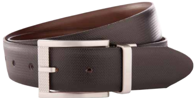
102 Black / Brown Reversible

35mm reversible textured leather strap with twist harness buckle featuring matching pattern.