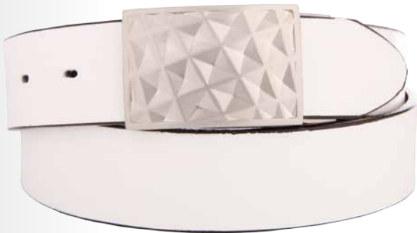
193 Black / White Reversible

35mm genuine leather cut edge reversible strap. Removable geometric design plaque buckle in brushed finish.