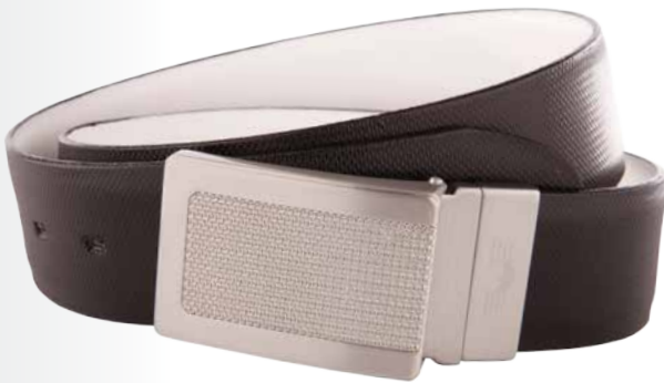
193 Black / White Reversible

38mm reversible textured leather strap with twist plaque buckle featuring matching pattern.