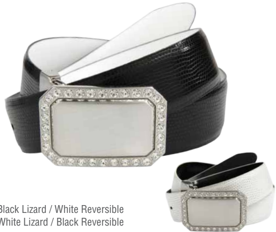
193 Black Lizard / White Reversible 740 White Lizard / Black Reversible

35mm genuine leather feathered edge reversible strap. Each strap features a lizard grain print reversing to a smooth grain. The removable plaque buckle with rhinestone detail is a proven favourite.