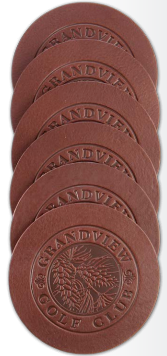
3.5" / 90mm Round