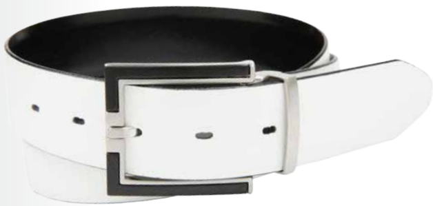
740 White / Black Reversible

35mm genuine leather feathered edge reversible strap. Removable harness buckle features matte black inlay design.