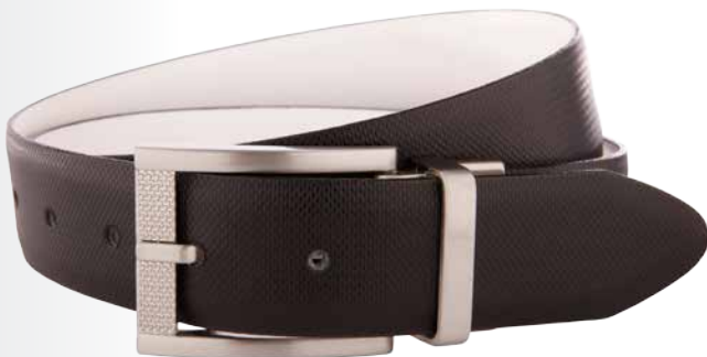
193 Black / White Reversible

35mm reversible textured leather strap with twist harness buckle featuring matching pattern.