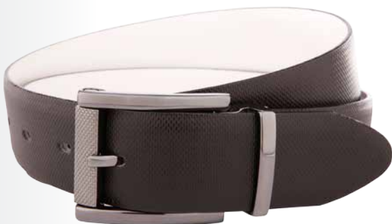
193 Black / White Reversible

35mm feathered edge textured leather reversible strap. Removable harness buckle in gunmetal finish and featuring unique textured roller detail.