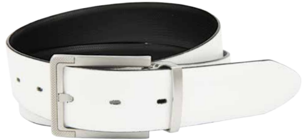
740 White / Black Reversible

35mm genuine leather feathered edge reversible strap. Removable harness buckle features textured design on buckle.