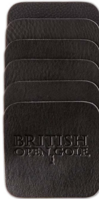
3.5" / 90mm Square