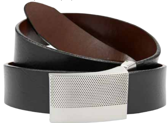
102 Black / Brown Reversible

35mm genuine leather cut edge reversible strap. Removable dimple detail plaque buckle.