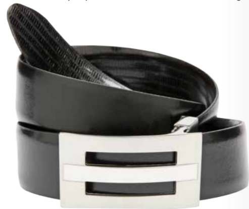
156 Black / Exotic Black Reversible

35mm genuine leather feathered edge reversible strap. Removable two tone fashion plaque buckle with cut out slot design.