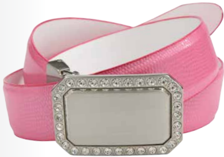
565 Pink Lizard / White Reversible

35mm genuine leather feathered edge reversible strap. Each strap features a lizard grain print reversing to a smooth grain. The removable plaque buckle with rhinestone detail is a proven favourite.