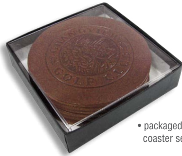
• packaged coaster set

Set up charge applies: refer to price list for details. (Hi-resolution image in JPG or PDF required)