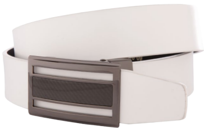
• 014130 101 Black 765 White