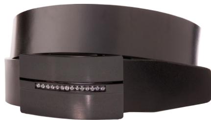
• 114121 101 Black