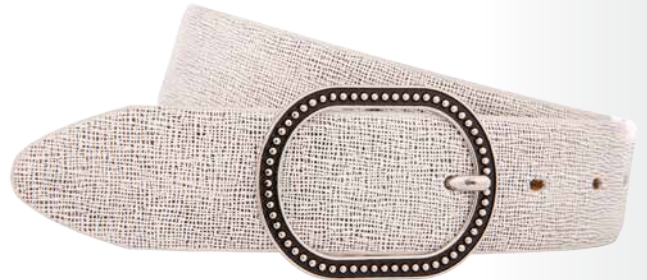
740 White / Black

35mm feathered edge genuine leather strap in a textured white and black mix. Paired with oval beaded removable center bar buckle.