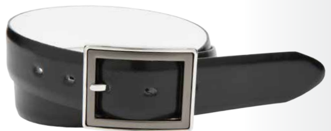
193 Black / White Reversible

35mm genuine leather feathered edge reversible strap. Removable two tone center bar buckle featuring polished nickel and matte gun metal finishes.