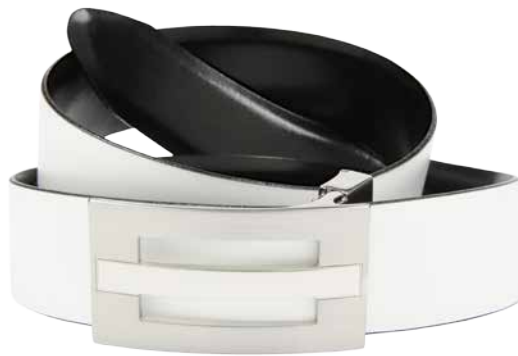
740 White / Black Reversible

35mm genuine leather feathered edge reversible strap. Removable two toned fashion plaque buckle with cut out slot design.