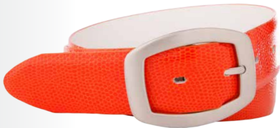
547 Orange Lizard / White Reversible

35mm genuine leather feathered edge reversible strap. Each strap features a lizard grain print reversing to a smooth grain. The removable center bar buckle has a brushed nickel finish.