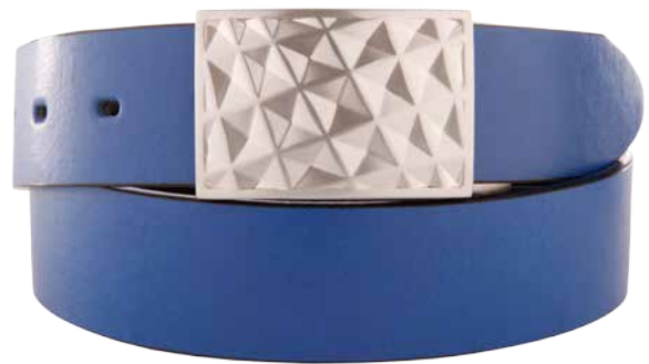
134 Black / Royal Blue Reversible

35mm genuine leather cut edge reversible strap. Removable geometric design plaque buckle in brushed finish.