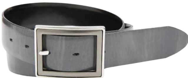
444 Grey / Black Reversible

35mm genuine leather feathered edge reversible strap. Removable two tone center bar buckle featuring polished nickel and matte gun metal finishes.