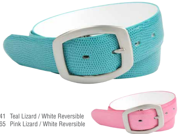
641 Teal Lizard / White Reversible 565 Pink Lizard / White Reversible

35mm genuine leather feathered edge reversible strap. Each strap features a lizard grain print reversing to a smooth grain. The removable center bar buckle has a brushed nickel finish.