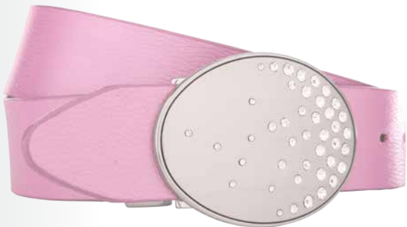
672 Spring Orchid

35mm pearlized pebble grain leather strap with removable oval plaque buckle. Buckle features scattered rhinestone design detail with brushed metal finish.