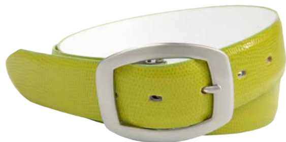
913 Green Lizard / White Reversible

35mm genuine leather feathered edge reversible strap. Each strap features a lizard grain print reversing to a smooth grain. The removable center bar buckle has a brushed nickel finish.