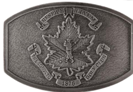
857 Antique Nickel