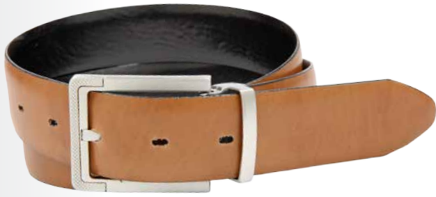
308 Tan / Black Reversible

35mm genuine leather feathered edge reversible strap. Removable harness buckle features textured design on buckle.