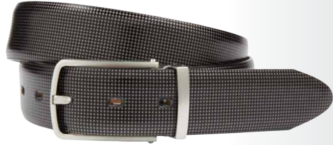
155 Metallic Black

35mm genuine leather feathered edge strap featuring unique two toned finish. Removable slim line harness buckle in brushed finish.