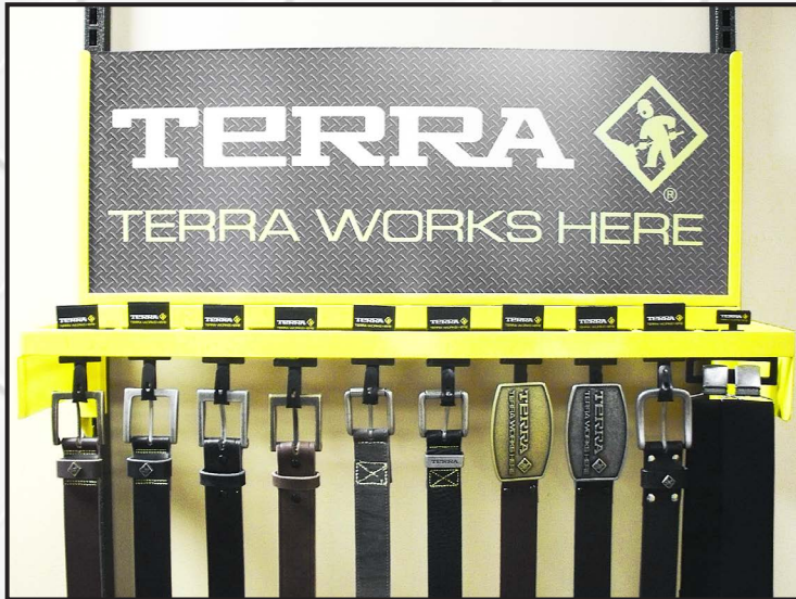
FIXTURE - FRONT VIEW