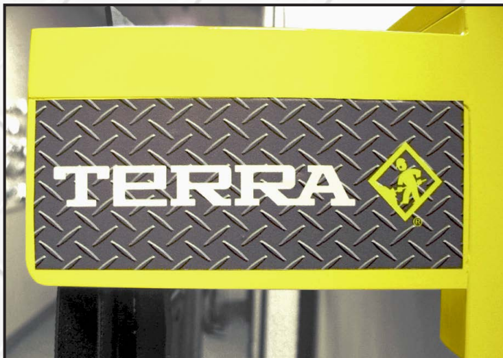
FIXTURE - SIDE VIEW